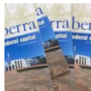
Canberra: Federal Capital